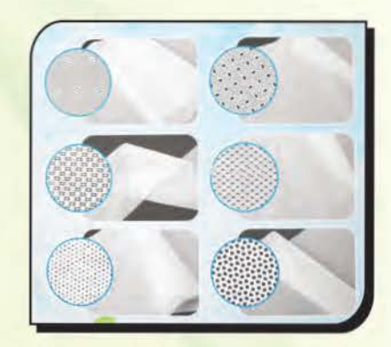
Perforated Poly Film (PPF)