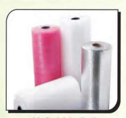
Air Bubble Roll