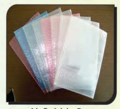
Air Bubble Bag