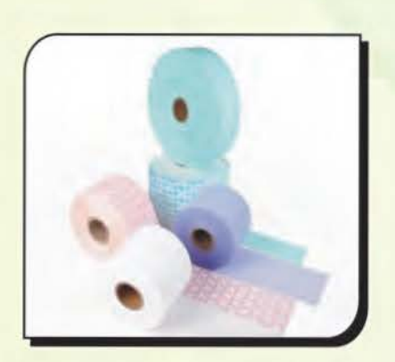
Sanitary Napkin / Diaper Back Sheet